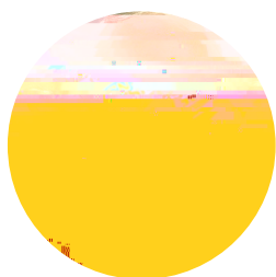
Renato Eda a key 8